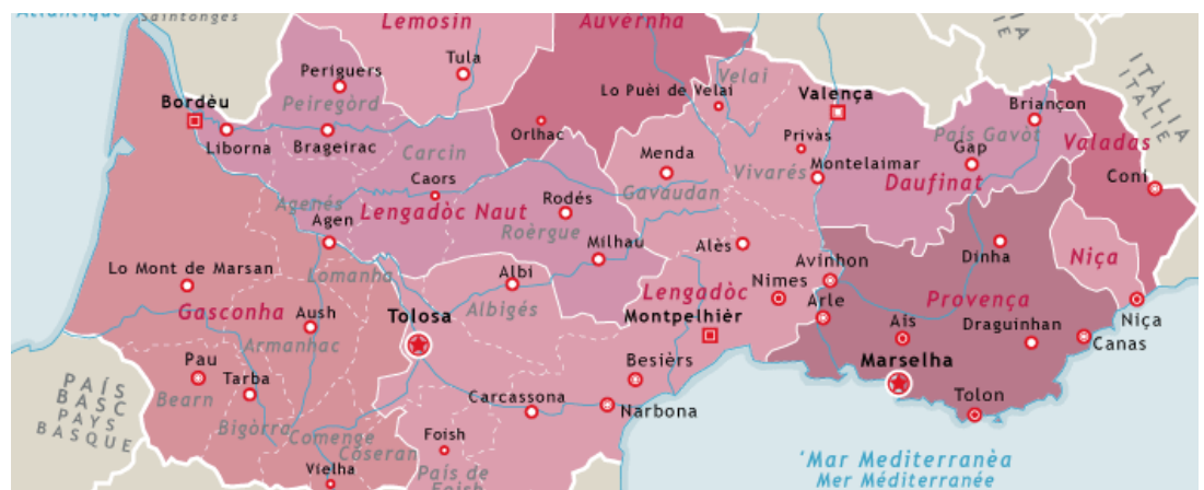
The languages of Oc

Note the V-shaped incline of the street, with the drainage water in the centre of this "gutter". Moreover, to avoid inconveniences, the noble ladies dressed in long dresses would pass flush with the dwellings (on the high side), hence the expression "tenir le haut du pavé". This alleyway seems to have been destined for the tanners, situated near the Dourdenne stream, its location is strategic since the tanning work requires a lot of water.