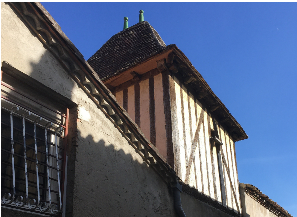
Dovecote in Fournils Lane

In the middle of this alley, turn left into ruelle des Fournils.