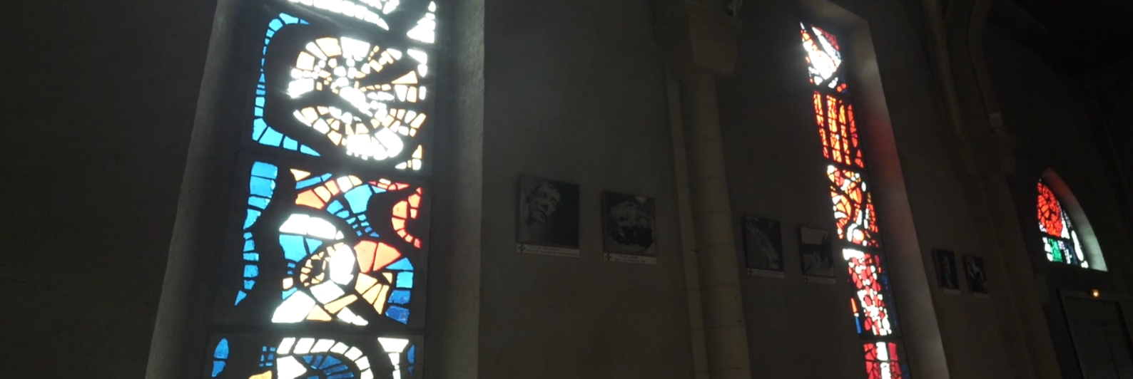
The stained glass windows of St. Mary's Church

Go around the roundabout and take rue Martignac. Turn into the first alley on the left.